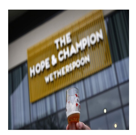
JD Wetherspoon to open first motorway pub on M40 Free 271224